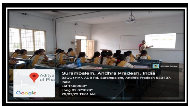
Digital classes with LCD projector