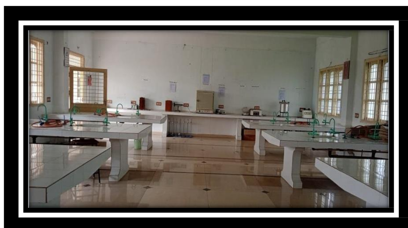
Well equipped labs