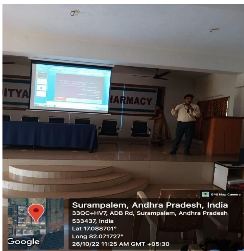
Student orientation program